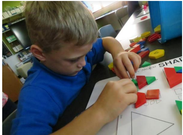
Millah engrossed in the investigation

Ms Yap's numeracy class undertook a mathematical investigation on shapes. Students were highly engaged and numerous findings were made.