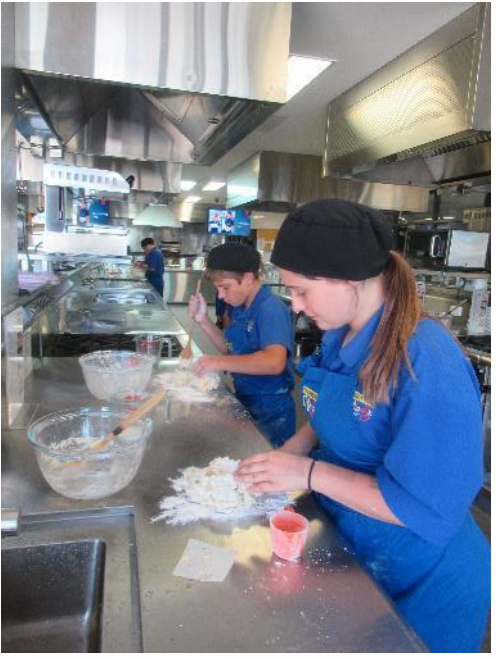
Gently kneading scone dough