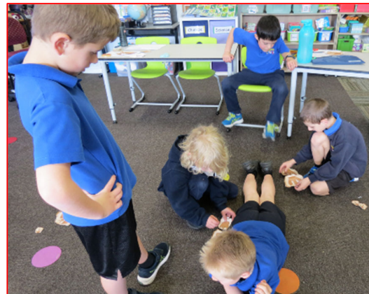
Year 1 Numeracy measuring in dinosaur feet

Miss Rees' Numeracy class, made pictures out of different coloured squares, then calculated the fraction of each colour used.