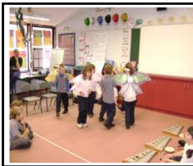
Pictured above: Prep / 1 Dancing

Yesterday we all had a fabulous afternoon singing, dancing, reading poems and stories to our families and friends. Thankyou to all P-4 staff who assisted with preparing the students for their performances.